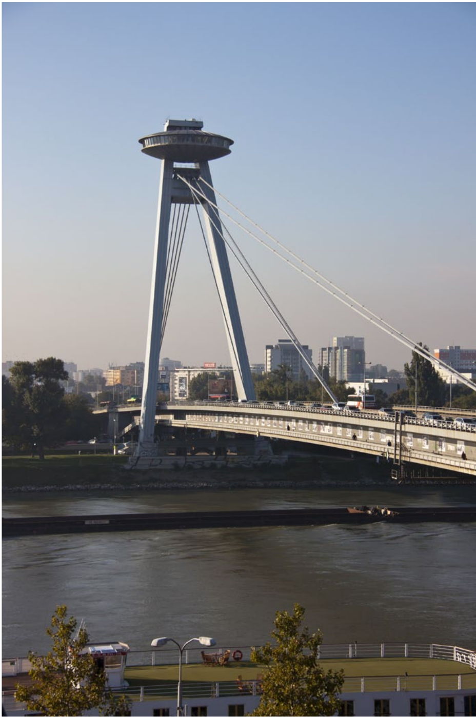
BRATISLAVA 30 Sept - 1 Oct 2013