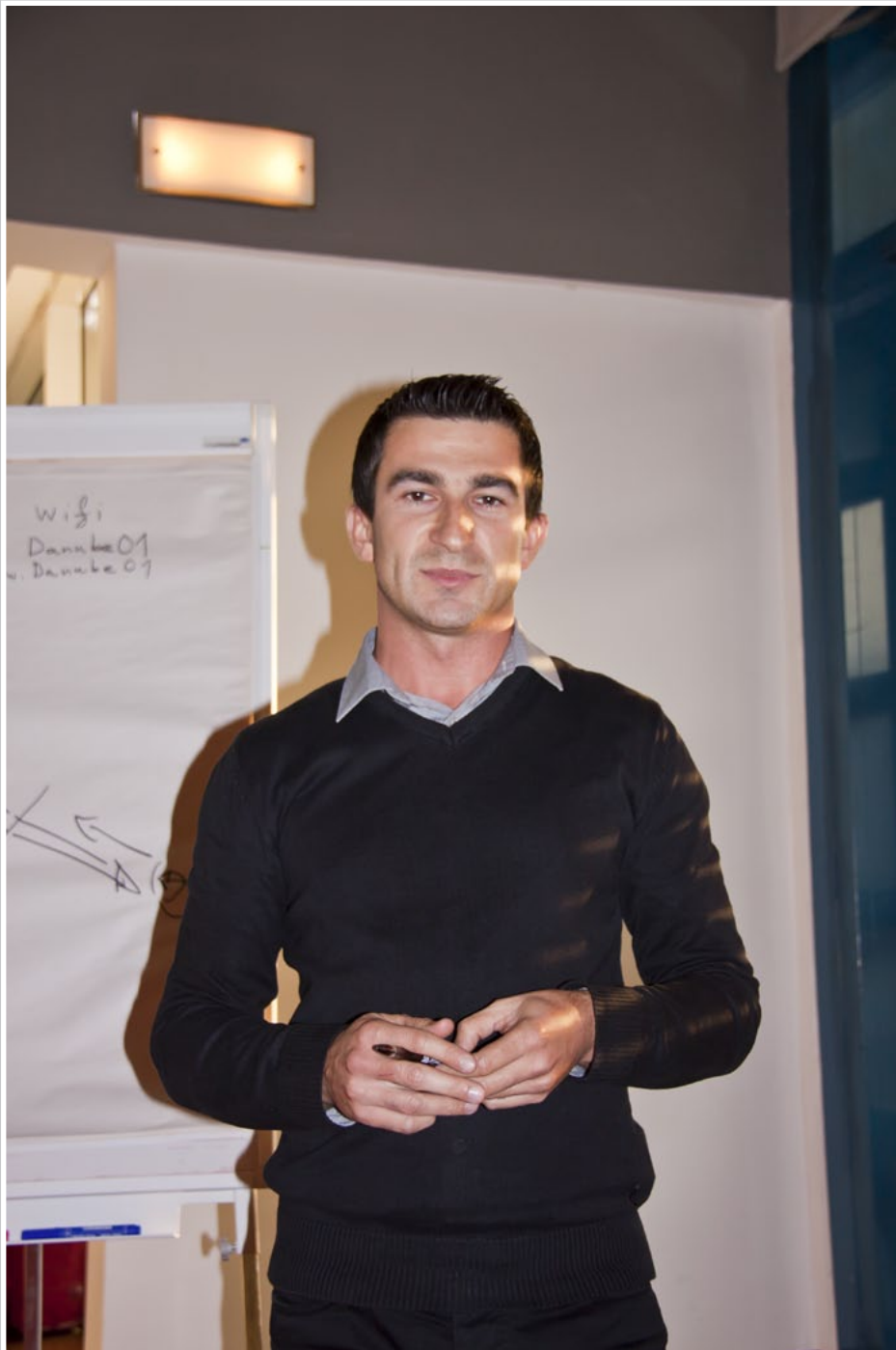
BRATISLAVA 30 Sept - 1 Oct 2013