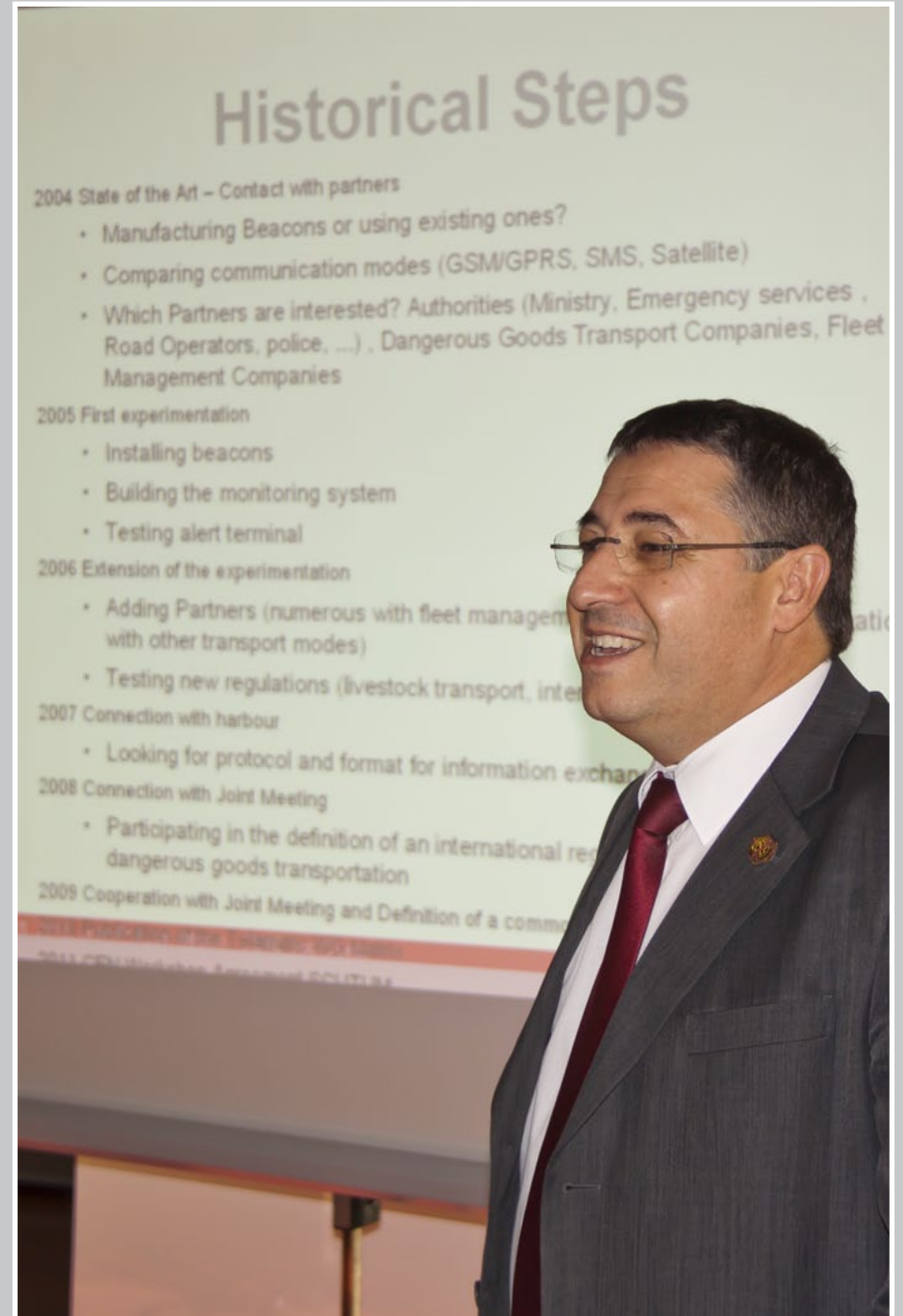
page 22 from 29