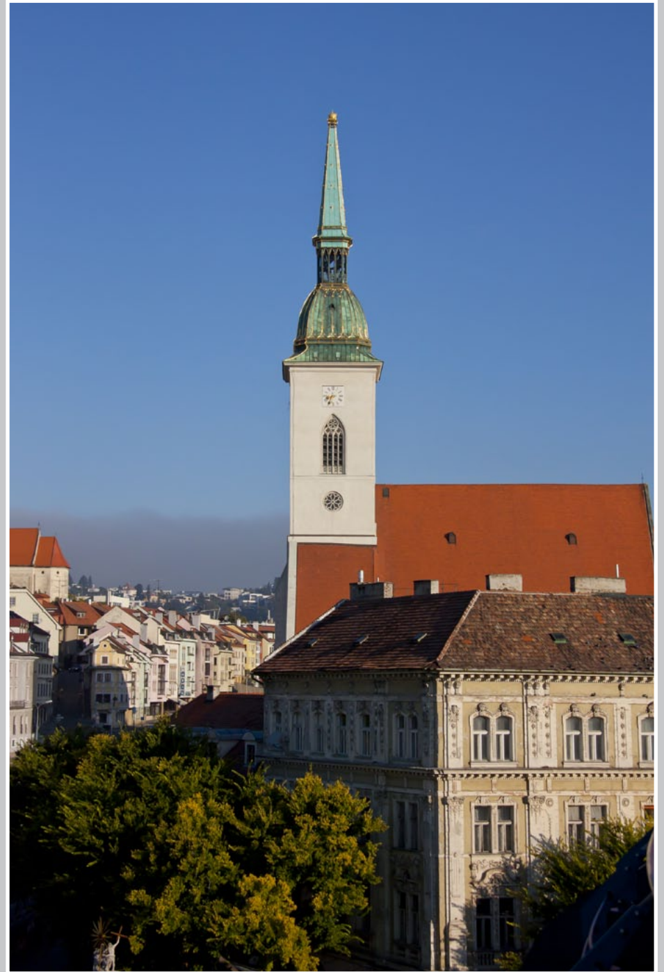
page 14 from 29